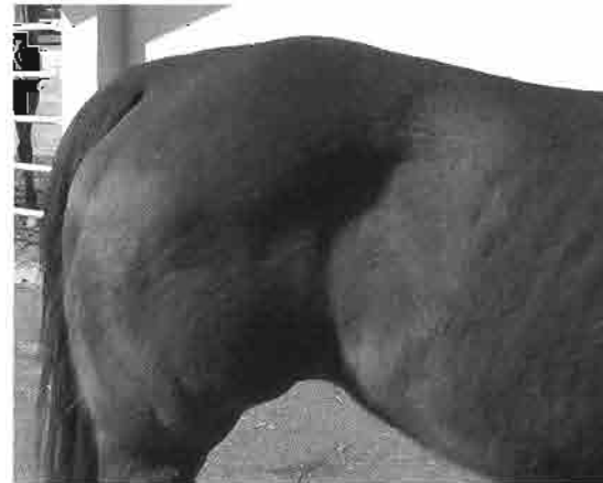
At left, the hip shows an inverted V shape with the spine at the apex, representing a lack of fat deposition.

and used in horse rations, so the refeeding program could be implemented easily in any area of the country.