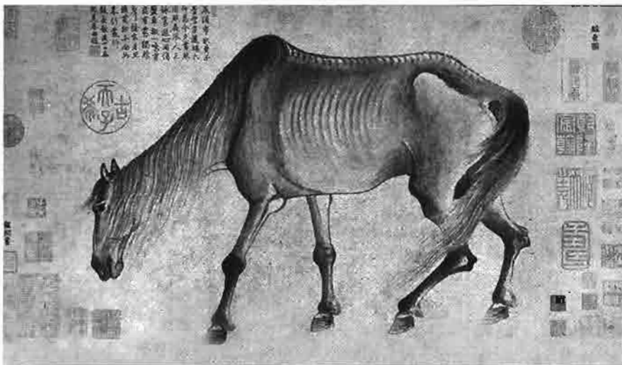
"Kung K'ai" (Emaciated Horse), by Yuan Dyn

refeeding the malnourished horse. In both humans and horses, abrupt refeeding can cause dysfunction of the body's metabolic systems, which can lead to failure of the heart and lungs and ultimately to death. The goal of this research is to provide new information and guidelines for