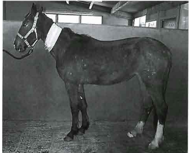
Powdered Sugar when she arrived in late April, still with her winter coat.

The horses arrived and were unloaded into a small pen. Halters were placed on each horse, and then they were led to a stall. It became obvious that for some this was a first halter experience, but they were tired and weak and easily coaxed into their individual stalls. These stalls were not bedded, since I was sure they would consume any type of bedding. Instead, large rubber mats on the floor provided cushion, and water was available at all times. We placed catheters in the jugular vein that night to facilitate blood collection each morning for the next 10 days. The study and