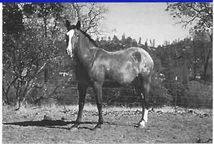
Powdered Sugar in late September, six months after starting rehabilitation. A successful refeeding program typically takes several months before the horse can obtain its proper weight.

Jane the morning of her parturition, and then stood by her and nuzzled her neck over the gate as the foal struggled to stand. He stood without a halter one afternoon while I bathed him in warm water and medicated soap as I tried to tend to his falling hair coat. But, the one moment I will always remember occurred on the morning of first feeding. I fed each horse their assigned meal and they all dug right into the feed. Several minutes later as I checked on each horse, Harry raised his head and let out a high-