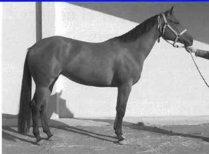
Above, this horse has a body condition score of five. She appears very smooth, with no skeletal prominence. Her neck and withers blend smoothly into her shoulders. Ribs do not show, and the loin and hip are nicely rounded. Below, this horse has a score of nine. Note the obvious crease from his spine sunk between fat deposits on either side.

Our research showed that starved horses had very different responses to several diets. We found that the best approach for initial refeeding of the starved horse consists of frequent small amounts of high-quality alfalfa. This amount should be increased slowly at each meal and the number of feedings decreased gradually over 10 days. After 10 days to 2 weeks, horses can be fed as much as they will eat. The horse will show signs of increased