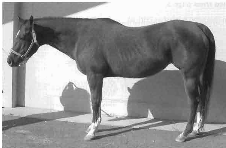
This horse has a body condition score of three. The ribs can be observed easily, even with the horse's winter coat, the tail head is prominent and can be felt easily, and the hip bones are rounded and protruding (above and below right). Note the dip in the withers in front toward the neck and behind toward the back, exhibiting little or no fat deposit around this area.

Refeeding starved animals, including humans, is not an easy process. In humans suffering from starvation caused by illnesses such as anorexia, cancer, or gastrointestinal obstruction, patients can develop "refeeding" syndrome when they are given concentrated calories, and this in turn can lead to heart, respiratory, and kidney failure usually 3 to 5 days after the initial meal. This same syndrome has been reported in the literature for horses. Thus, our research team wanted to develop a refeeding program for horses that would minimize these effects and enable the horse to return back to normal body weight. Our goals were to test feeds that were commonly available