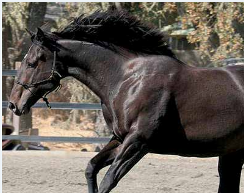
Cowboy after 3 months of rehabilitation.

Cowboy was purchased by a concerned passer-by and taken off the property to a new home. The new owner immediately