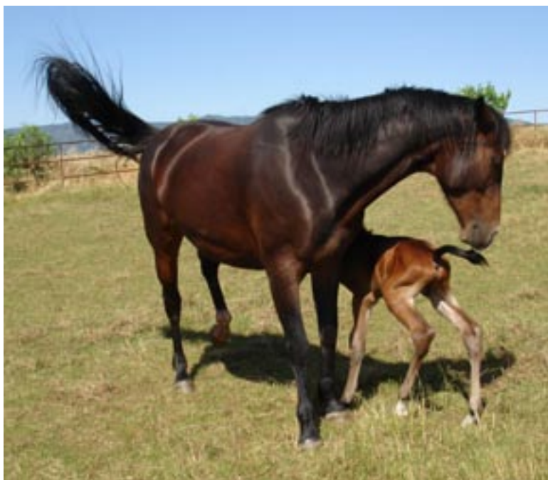
This mare is displaying strong threatening behavior toward her foal (pinned ears, swishing tail, lifting hind leg to kick, slightly open mouth) that is characteristic in foal rejection. See page 8 for story.

Consider some possible reasons for this. Horses divide their time between activities that allow them to satisfy their basic requirements for food, water, movement and rest. When comparing the activities of free-ranging horses with those of stabled horses, we find a significant discrepancy between the time spent walking or standing and that spent eating. Free-ranging horses generally spend about 60% of their time eating and 20% walking, while stabled horses generally spend about 15% of time eating and 65% standing. Clearly, there is a substantial amount of time available for domesticated horses to develop undesirable behaviors due to coping