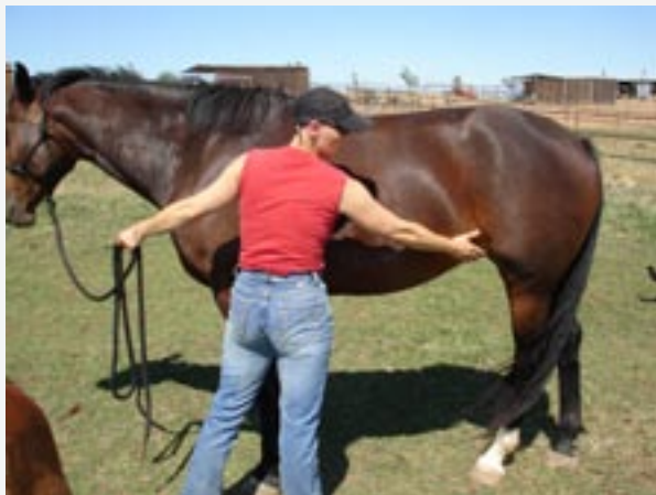
The mare's sensitive area was a palm-size spot on the outer and inguinal side of her left and right flank.

The clinician was able to determine that the mare's sensitive area was a spot the size of the palm of a hand on the outer and