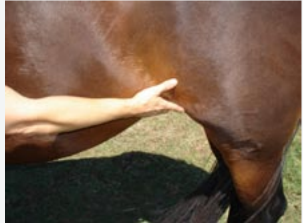
After several sessions of desensitizing and counter-conditioning, the mare was able to tolerate touching and bumping of the area. Photo below shows greater force in touching.

inguinal side of her left and right flank. After several short sessions of desensitizing and counter-conditioning, the mare was able to tolerate touching and bumping of the area. The foal was eventually brought to the mare under carefully controlled conditions and immediately attempted to nurse. During each nursing, the mare was rewarded with a treat.