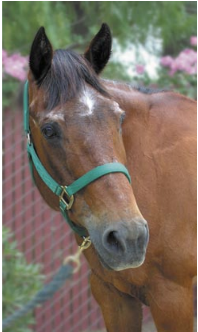
Taddy is a Quarter Horse mare born in Nebraska on April 21, 1976. That makes her 30 years old! She has had 18 foals over her lifetime. Since coming to live at the Center for Equine Health at age 23, she has had no major health problems other than a colic watch and corneal ulcer. Taddy is a remarkable example of healthy old age.

Finally, older horses do not handle changes in environment or routine well (see the Rule of More and Less in Director's Message). A stable and consistent