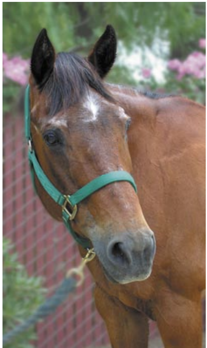
Taddy is a Quarter Horse mare born in Nebraska on April 21, 1976. That makes her 30 years old! She has had 18 foals over her lifetime. Since coming to live at the Center for Equine Health at age 23, she has had no major health problems other than a colic watch and corneal ulcer. Taddy is a remarkable example of healthy old age.

Finally, older horses do not handle changes in environment or routine well (see the Rule of More and Less in Director's Message). A stable and consistent